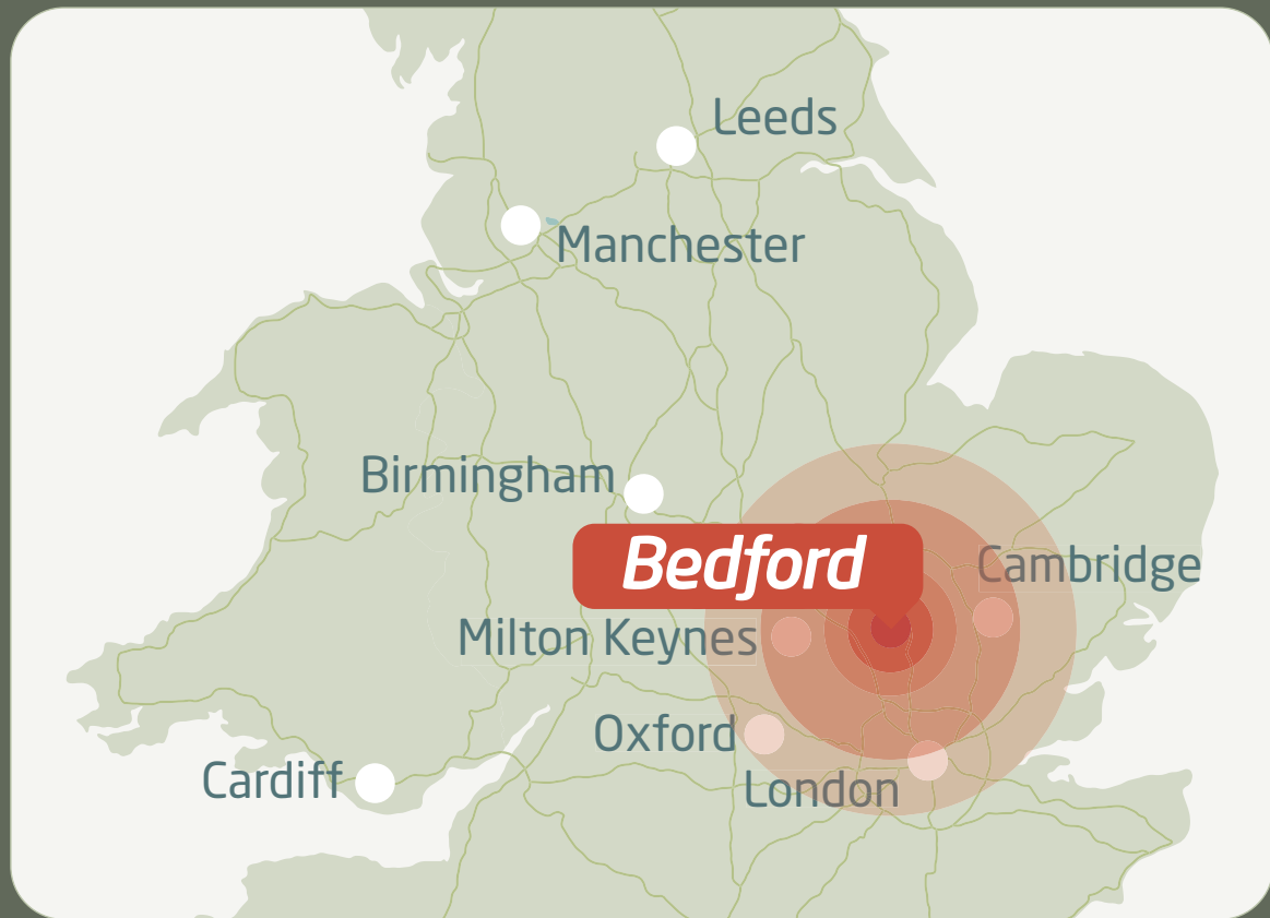
Map produced by Urban Graphics

Our area encompasses dozens of exciting projects which will provide thousands of new homes; help to create thousands of new jobs and deliver significant transport and environmental infrastructure improvements.